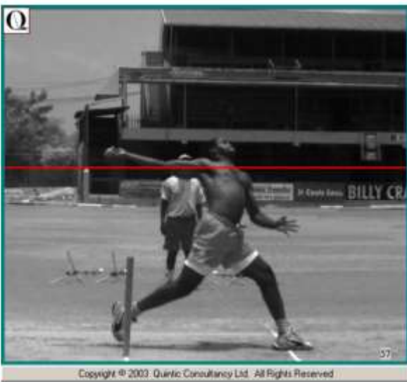
Figure 1a: Arm Horizontal – NO